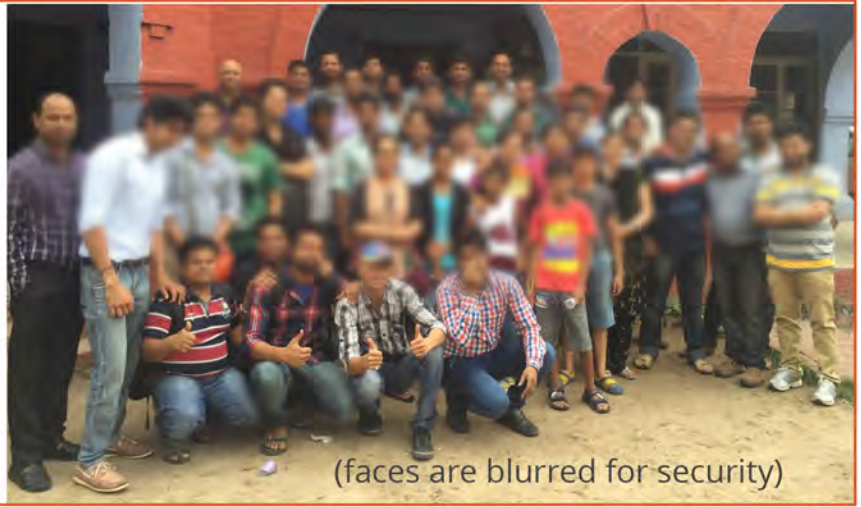
(faces are blurred for security)

We are grateful for the ministry that has flourished here: India has about 3,000 Deaf believers that came to know Jesus through the 2-BY-2 program. Praise God!