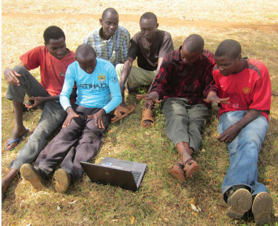
Deaf experiencing the Scriptures in sign language video translation.