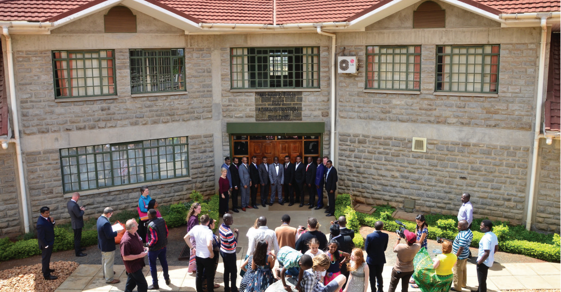
The campus in Nairobi, Kenya trains many evangelists, translators and leaders for Deaf reaching Deaf.